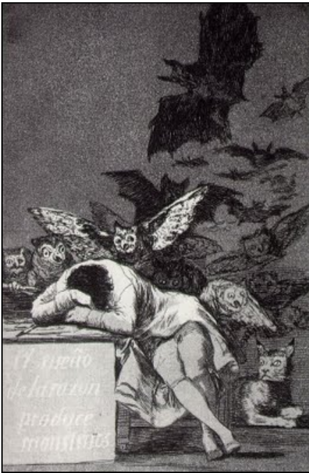
Francisco de Goya: The Sleep of Reason (1799)

—Friedrich Nietzsche, German philosopher/thinker (1844-1900)